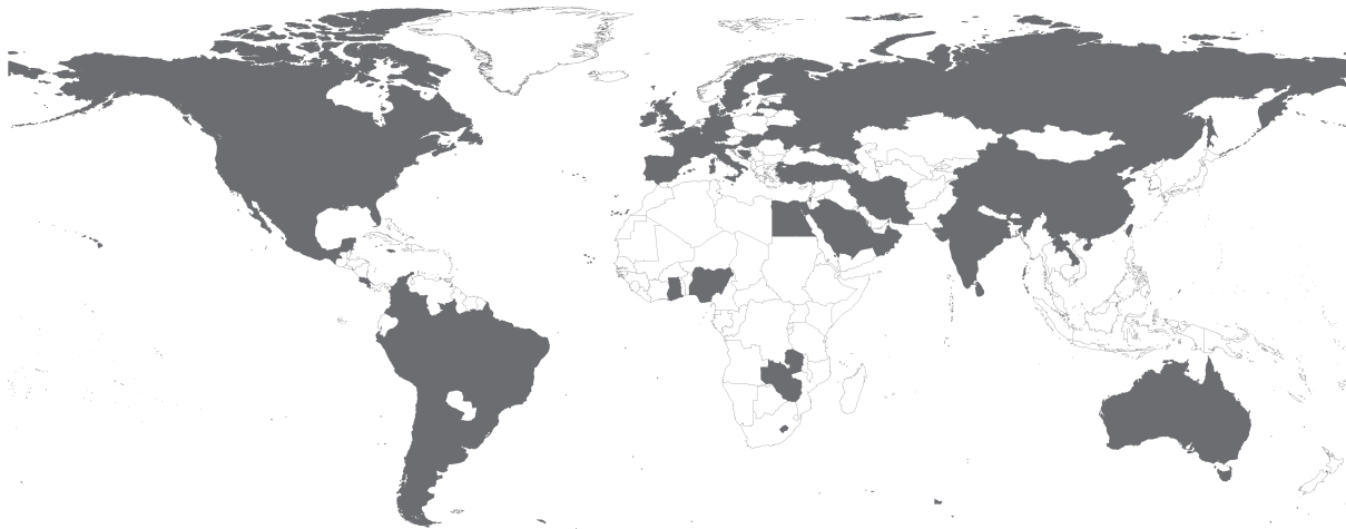
Fig. 2. World map showing countries associated with IMGA (after http://www.medicalgeology.org ).

Future medical geology research should focus on the various evolving areas of research in geo-environmental health. Concerns include environmental pollution, climate change impacts, plastics, heavy metal contamination, pandemics/epidemics, and so on. It was observed that there had been a drastic increase in human exposure to geo-environmental contamination as a result of an increase in the